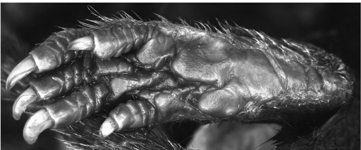
Fig. 2. Fore- and hindfoot of the holotype specimen of Surdisorex schlitteri n. sp. (FMNH 195069); length of hindfoot (including claws) is 16.1 mm.